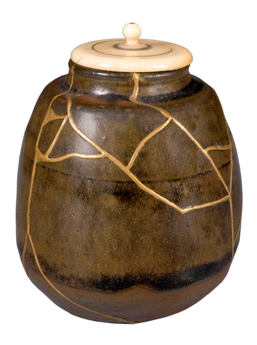
→ TEA CONTAINER (chaire), 18th century, Karatsu ware, H.: 2 3/4 in. (6.8 cm), D.: 2 3/8 in. (6.1 cm), Museum für Lackkunst, Münster, Germany, Inv. no. AS-J-c-31