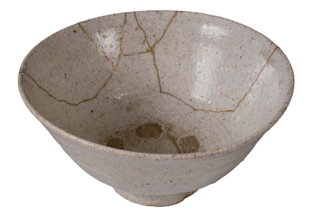
\rightarrow TEABOWL ( chawan ), 17th century, Korea, H.: 3 3/8 in. (8.5 cm), D.: 6 7/8 in. (17.5 cm). From the collection of Fujikawa Kokusai [Bunkido] (1807–1887), a lacquer artist.