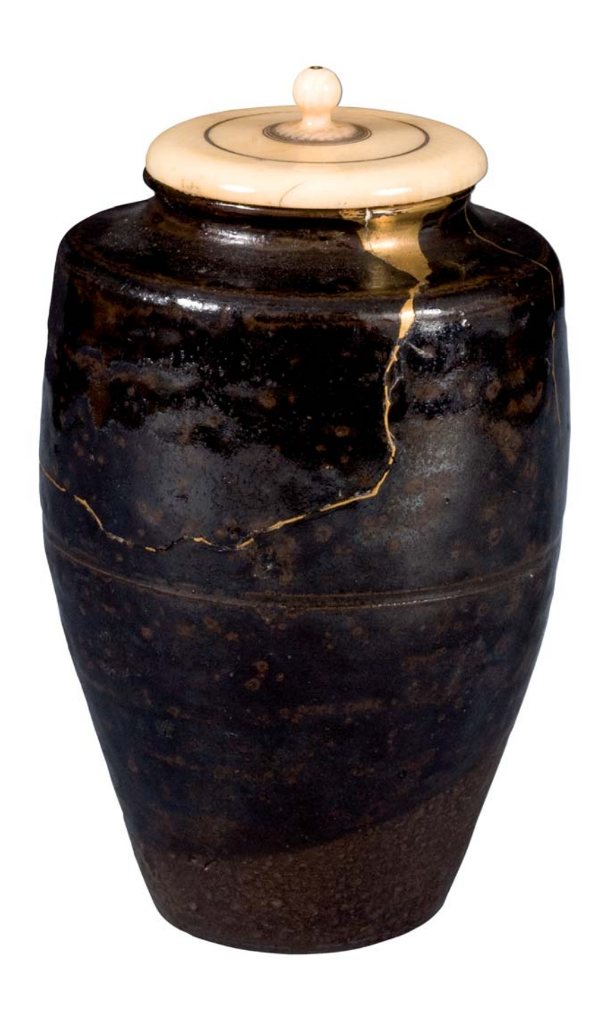
→ TEA CONTAINER (chaire), 18th century, Seto ware, H.: 2 7/8 in. (7.4 cm), D.: 2 in. (5.0 cm), Museum für Lackkunst, Münster, Germany, Inv. no. AS-J-c-30