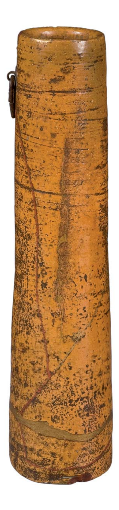
→ FLOWER VASE (hana tsutsu), Ohi Chozaemon [Hodoan] (1630–1712) attr., Ohi ware, H.: 10 3/8 in. (26.3 cm), D.: (Rim) 1 7/8 (4.7 cm), D.: (Bottom) 2 1/2 in. (6.2 cm)