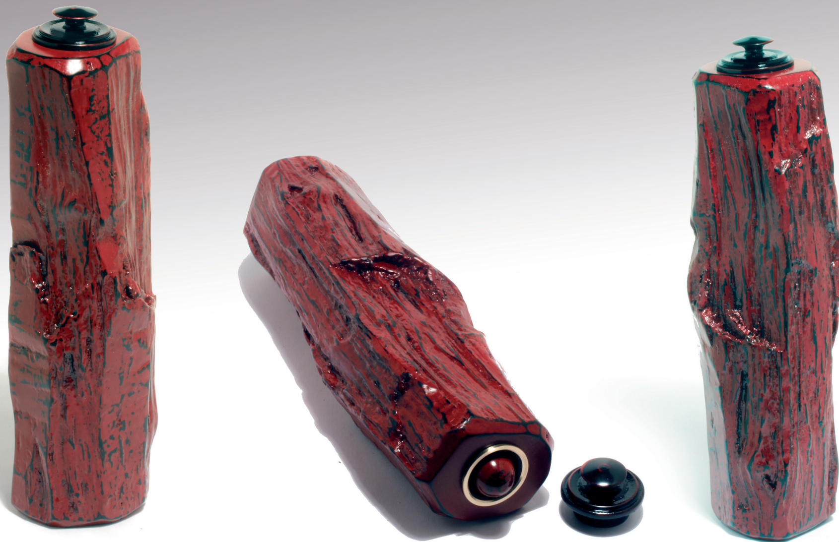
NEGORO PEN CASE „KIGIRE“ (a piece of wood)