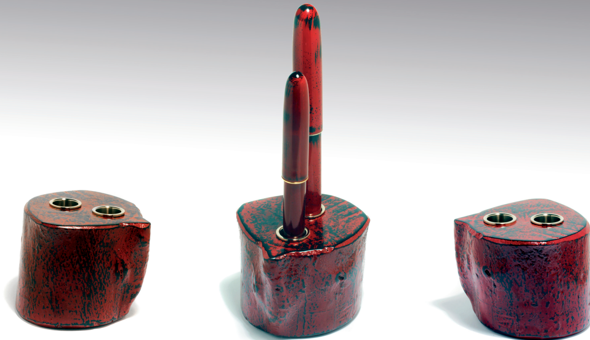
NEGORO PEN STAND „KIGIRE“ (a piece of wood)