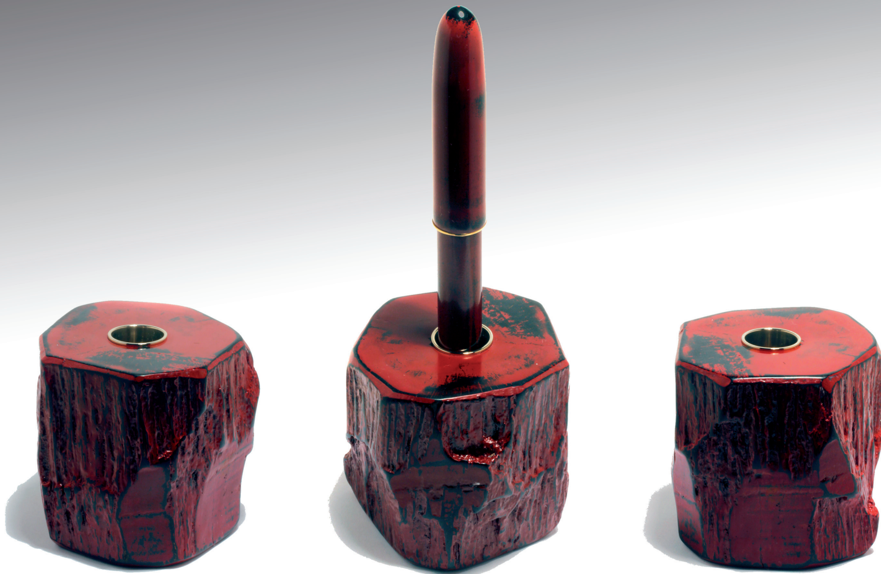
NEGORO PEN STAND „KIGIRE“ (a piece of wood)